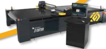
CONTINUOUSLY CUT USING WITH PRINT TO CUT EQUIPMENT