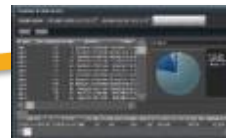
EASILY ACCESS RELEVANT JOB DETAILS AND METRICS