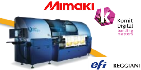
PRINT ON A DIGITAL TEXTILE PRINTER