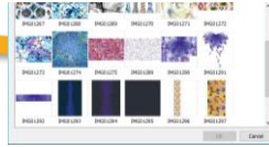
LINE PLANNING, DEVELOPMENT, DESIGN