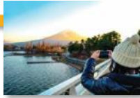
MOBILE APP CAPTURES AND SHARES INSPIRATION