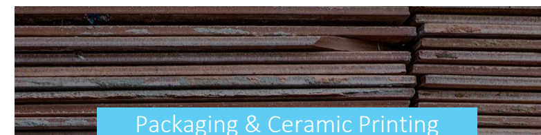
Packaging & Ceramic Printing