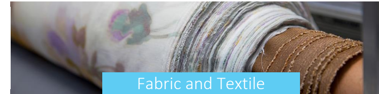
Fabric and Textile